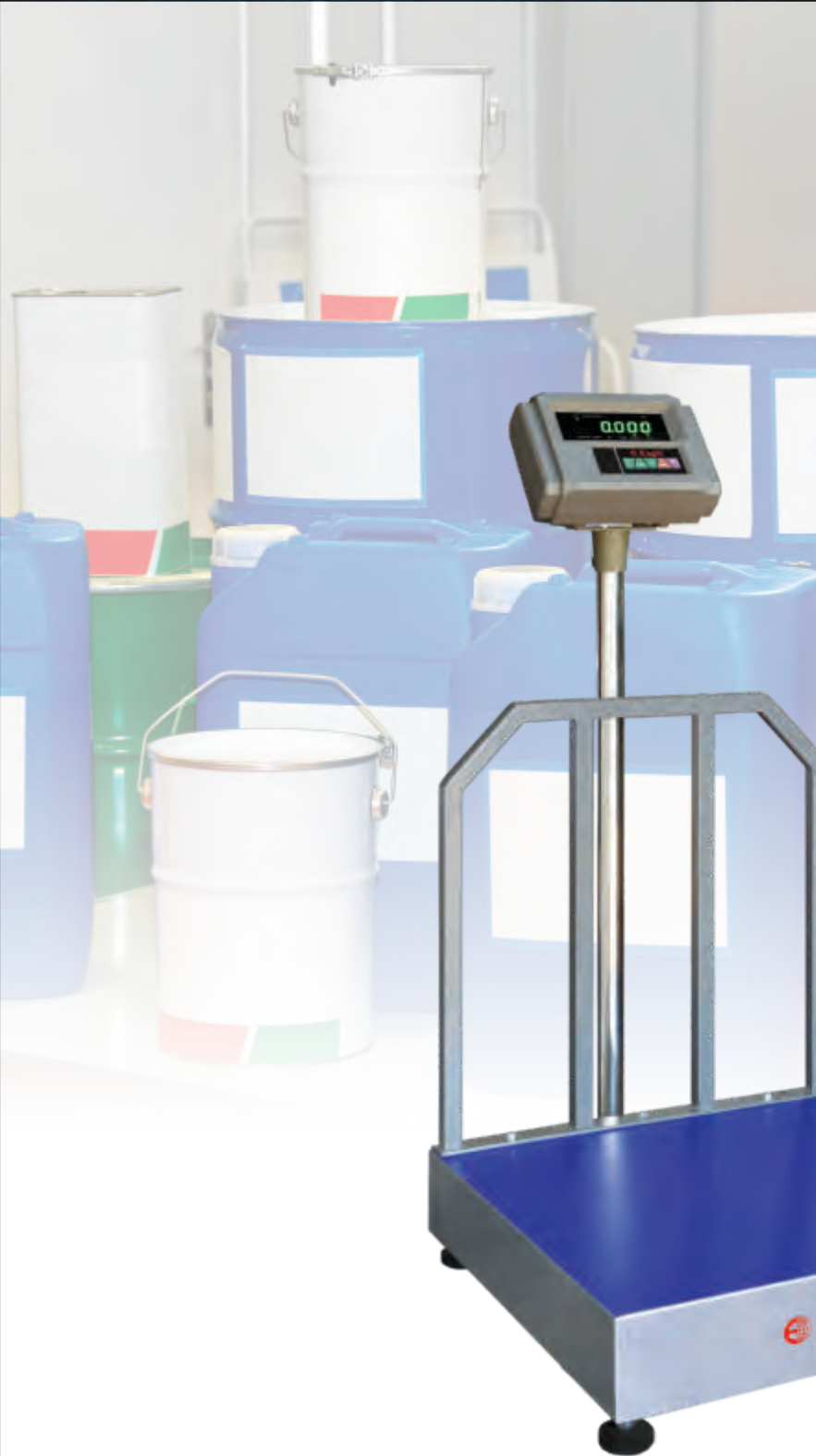
PLT Series Platform Weighing Scale