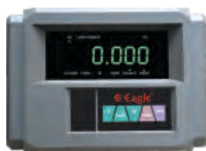
Indicator Front Panel