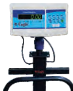
Handles for Easy Movement