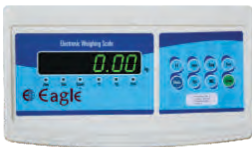
Indicator Front Panel